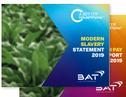
Modern Slavery Statement and UK Gender Pay Report 2019

Our Annual Report 2019 provides details of our evolved Group strategy, with sustainability at its heart. This includes our clear corporate purpose to build ‘A Better Tomorrow’ by reducing the health impact of our business through offering a greater choice of enjoyable and less risky products.