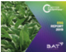
ESG Report 2019